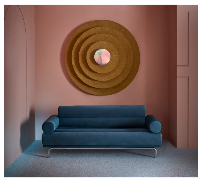
Figure 1 SDN Tufted Broadloom Carpet

Belgotex is a leading South African carpet and artificial grass manufacturer.